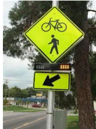
Ground Mounted RRFB